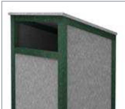
FRONT TO BACK SLOPE