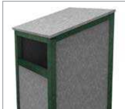
BACK TO FRONT SLOPE